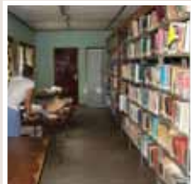
The library at NTC