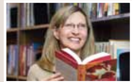
Moody Publishers have produced Christian resources for over 100 years.