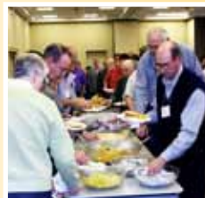
RHMA Conferences provide fellowship and encouragement to pastors who are often isolated in rural ministry.