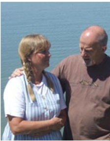
Baptizing New Believers