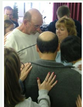
Fellowship at Preston Community