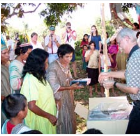
Receiving Bibles in their language