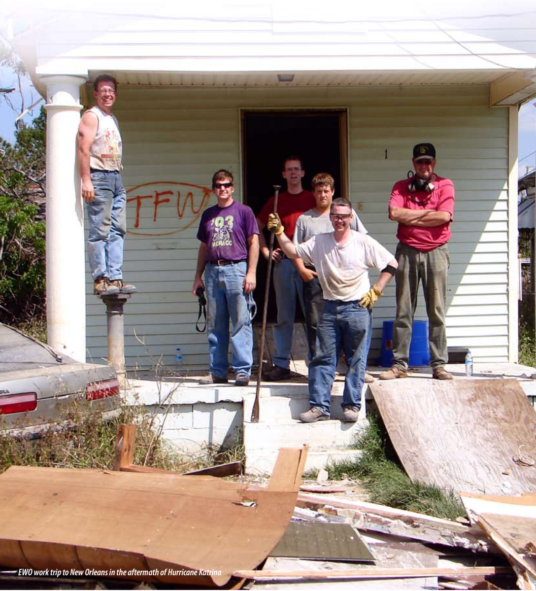
EWO work trip to New Orleans in the aftermath of Hurricane Katrina

“Continue earnestly in prayer ...praying for us, that God would open to us a door for the Word , to speak the mystery of Christ...” Colossians 4:2-3